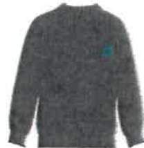
1105050 Wool Blend Jumper