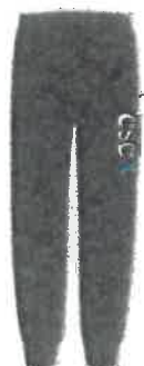
1110737 Nylon Trackpant Zip Cuff