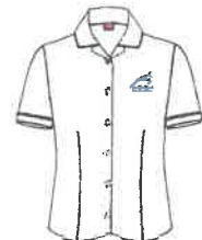
1101148 Short Sleeve Blouse