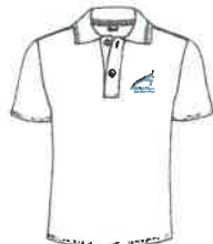
1100115 S/S Polo