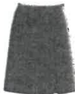
1104001 Winter Box Pleat Skirt