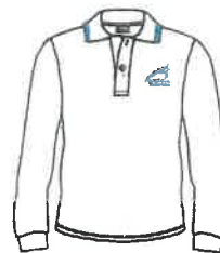
1100185 L/S Polo