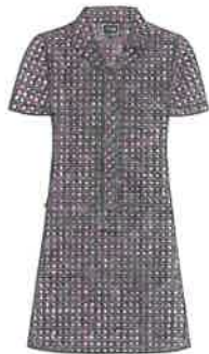
1100565 Summer Dress