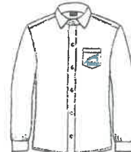
1101055 L/S Shirt