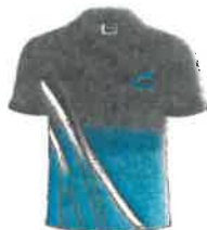
1111889 Sublimation Polo