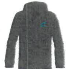
1118046 Hooded Soft Shell Jacket