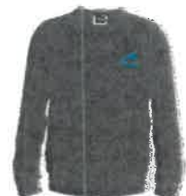
1100230 V-Neck Windcheater