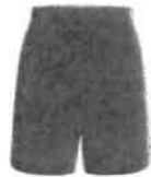
1111927 Tailored Short