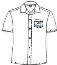
1101015 Short Sleeve Hip Shirt