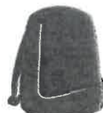
8301105 Back Pack